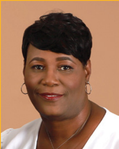
HOUSTON COMMUNITY COLLEGE HOUSTON, TX