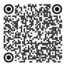
Download the Apple version

Scan or click on the QR code below or search the Apple app store for “Association of Community College Trustees” to download the mobile app to your phone or other mobile device.